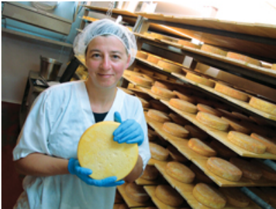
A staff of six work on making and aging Pied-de-Vent